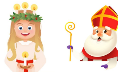
Two familiar icons of Advent: Lucia and the Bishop of Myra, aka St. Nicholas

The following Sunday, December 15, we will honor Sankta Lucia, whose feast day, December 13, recalls the witness of Lucia of Syracuse. Martyred at age 20 for refusing to deny her faith, legend has it that her appearance to the people of Sweden